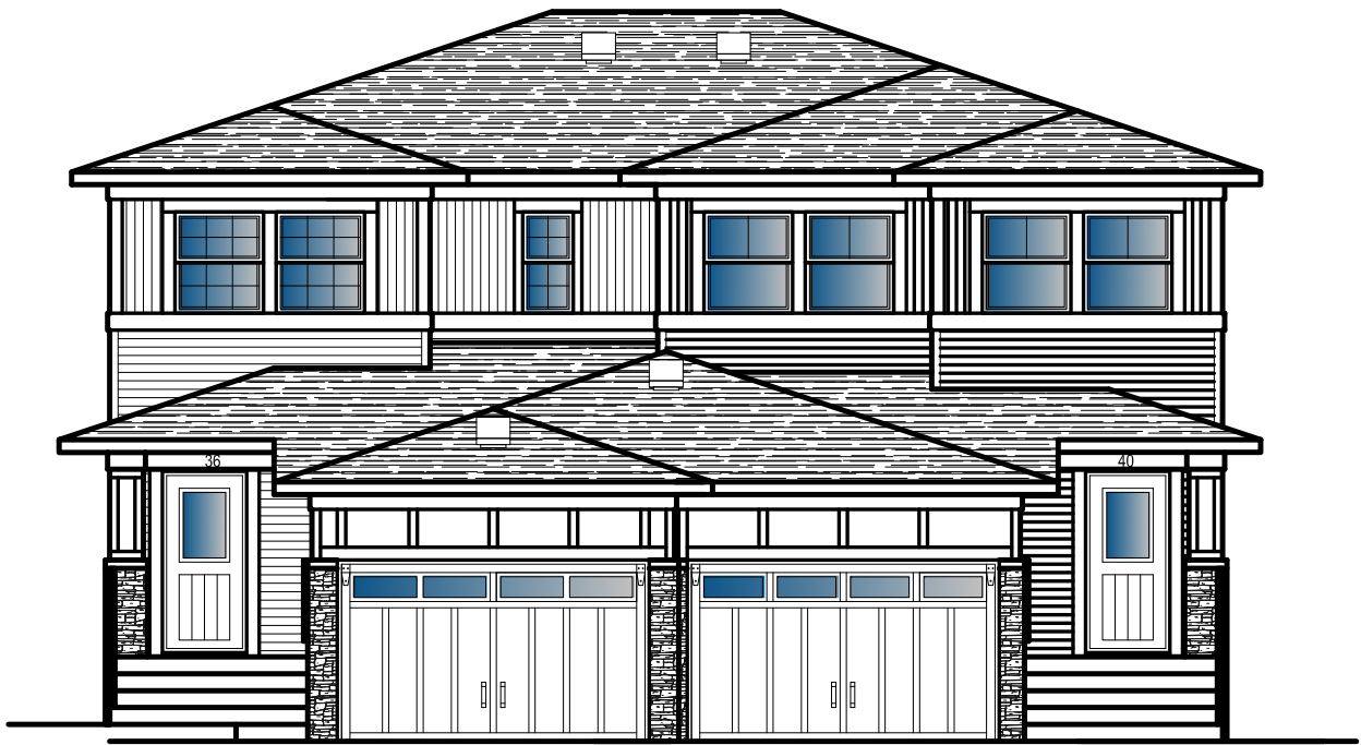
FRONT ELEVATION UNITS 36/40